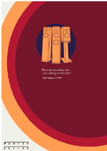
2003 product brochure

The solution to Leif's problem arose when he fitted new bass units with cones in pure ceramic. It was a eureka moment and the first Marten loudspeaker was born. It was a 2-way, floor standing model with one bass unit and one tweeter. Leif christened it Mingus. The next model was a bigger 2,5-way floor stander, that he called Miles. Now in its fifth version, Miles is still available today.