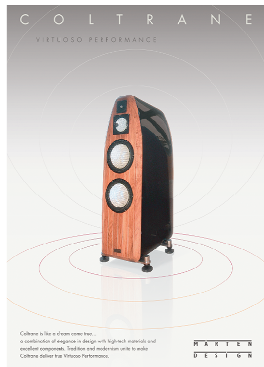
first Coltrane brochure

The Coltrane made the Marten name famous all over the world. Then it was time to revisit past Marten models with what new experiences brought. These remodelled classics became the Heritage series.